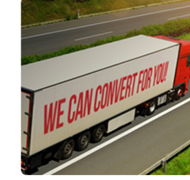
TRUCK & TRAILER