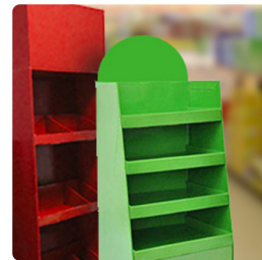
P.O.P. / DISPLAYS