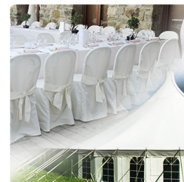
HOSPITALITY / STAGING / EVENT PRODUCTION